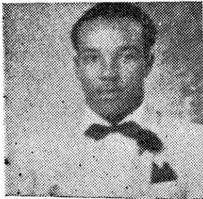
Soloist “Because” “For You Alone”