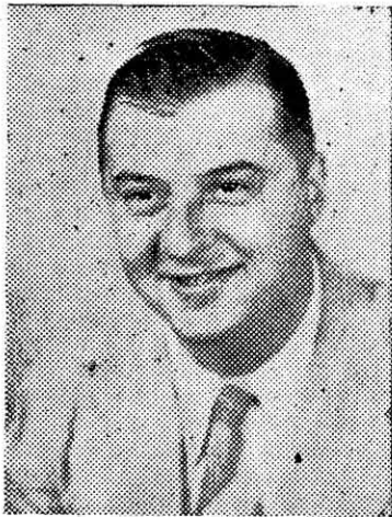
Representante Oficial del UPWA—CIO

parar los requisitos necesarios en la afiliación de la Unión de Trabajadores del Canal a la CIO y inmediatamente un programa para obtener mejores sueldos y seguridad de trabajo para los empleados de la Zona del Canal.