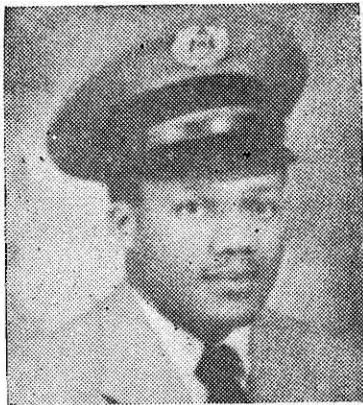
Director Anticipates successful performance