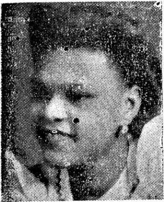
Soloist “The Kiss Waltz” “Sing On”